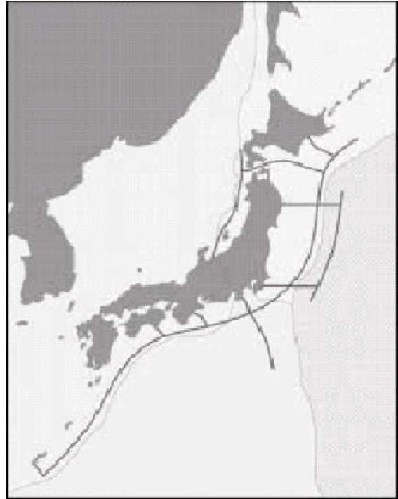
Figure 2-1 Future Network Configuration envisaged under ARENA Project

It is envisaged to lay two cables off Sanriku to sandwich the plate boundary. This configuration makes it possible to observe plate movements from both sides of the boundary, as well as enabling the acquisition of