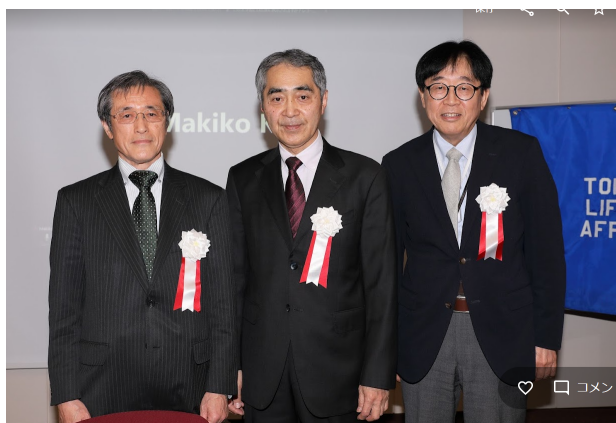
LMAG-Tokyo Officers 2023