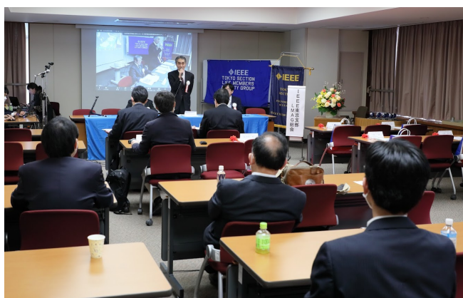
LMAG-Tokyo Annual General Assembly 2023

The 2023 Annual General Assembly of Tokyo Section Life Members Affinity Group was held on Friday, March 17 at 2:10 p.m. in online conference format. The number of attendees was 30 (Venue: 16, Online: 14). Activity report of 2022 and Action plan for 2023 were presented. All agendas were deliberated and approved.