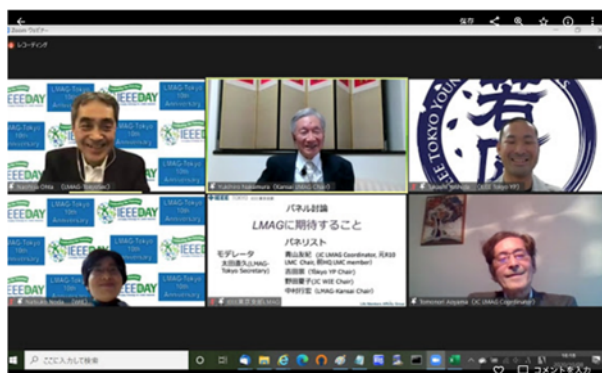
Active panel discussion