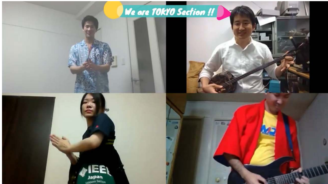
Movie posted for the contest

As a result, we are honored to win second place, while we are not sure what was really appealing: our attitude to make possible contingency even fun, our performance showing still strong connection with people in this time and age, or our looking like just having fun.