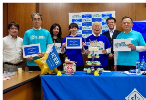
Participants in the venue