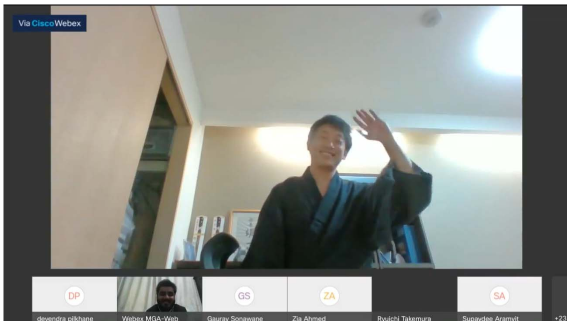
Online live performance