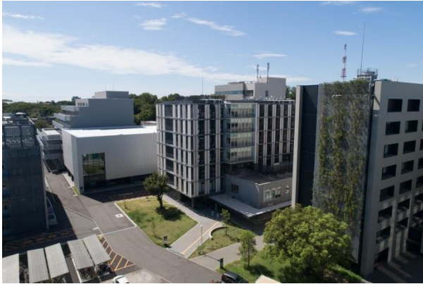
Institute of Materials and Systems for Sustainability