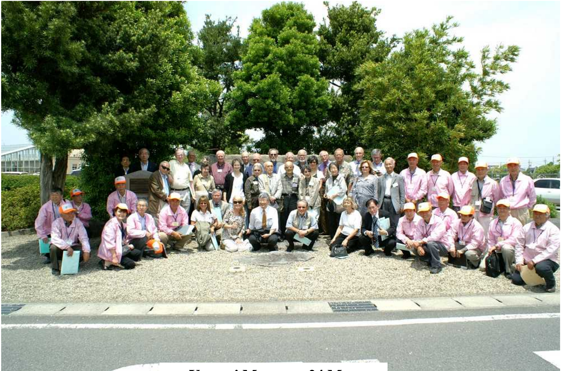
Yosami Museum, 24 May