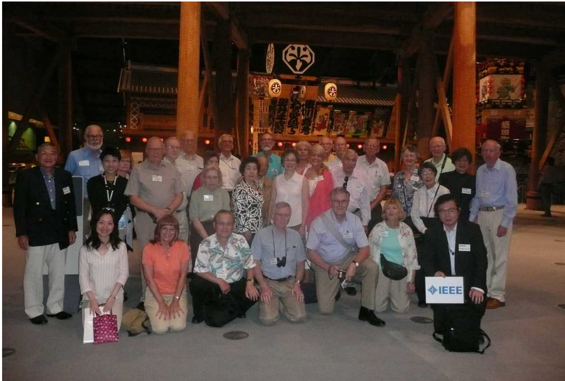
Edo-Tokyo Museum, 27 May