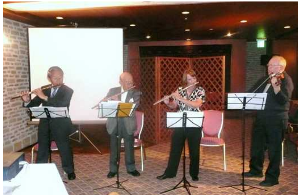
Ad Hoc Joint Quartet at the Farewell, 27 May