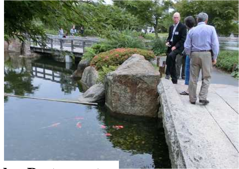
Tokugawaen Garden Restaurant