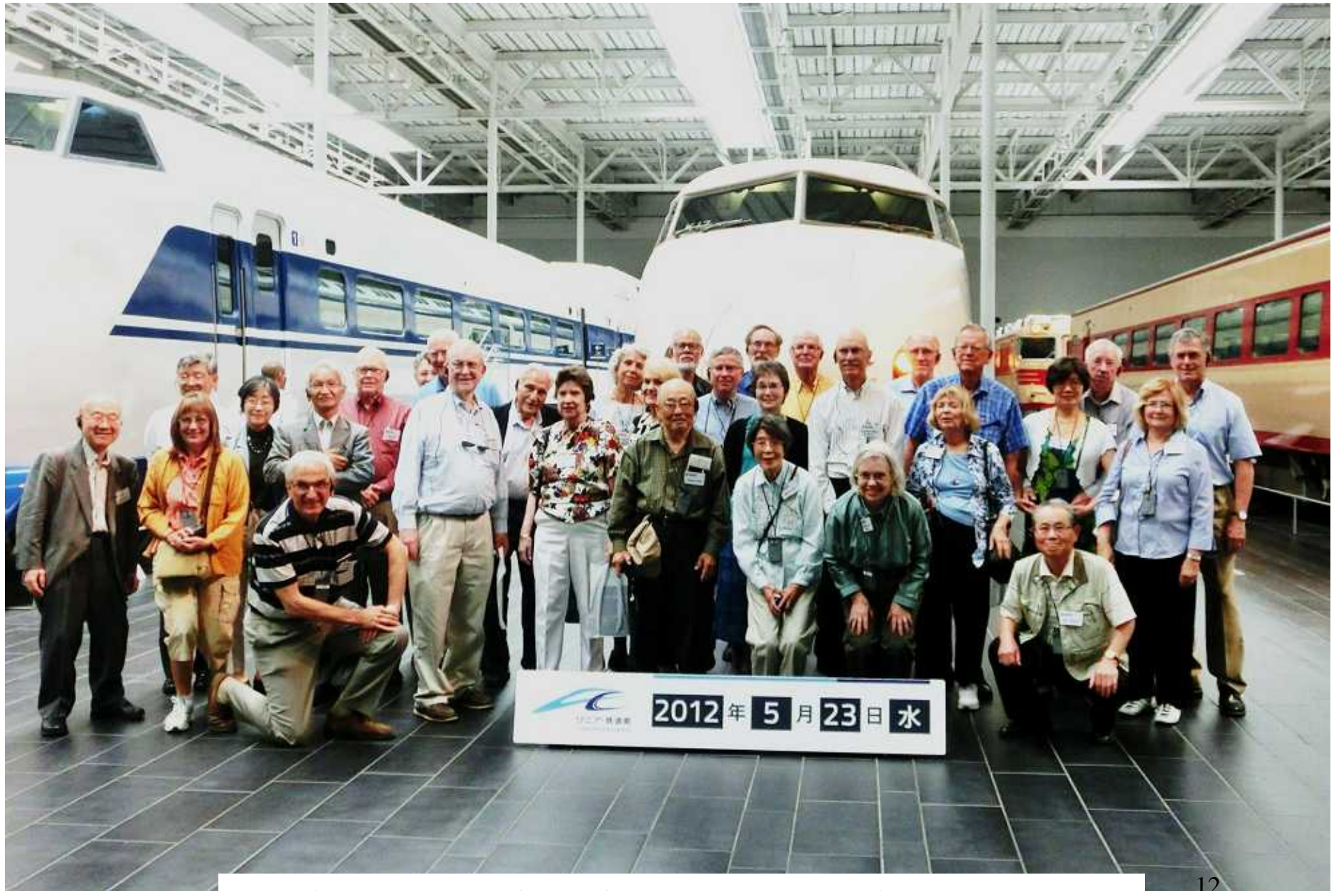
Railway Park of the Central Japan Railway, 23 May