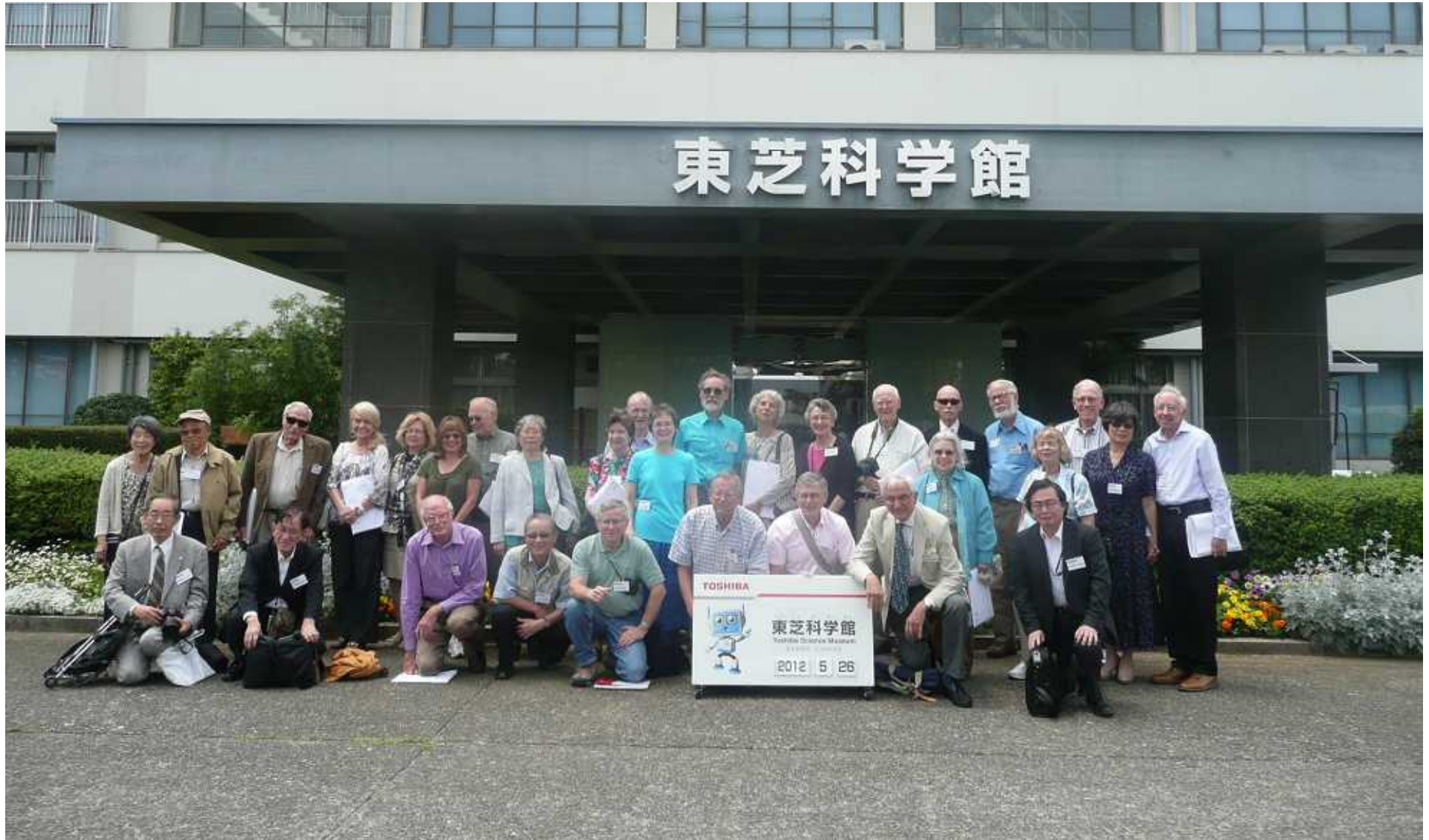
Toshiba Science Museum, 26 May