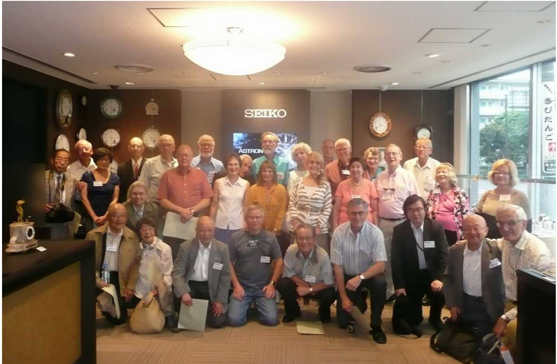
Seiko Museum, 25 May