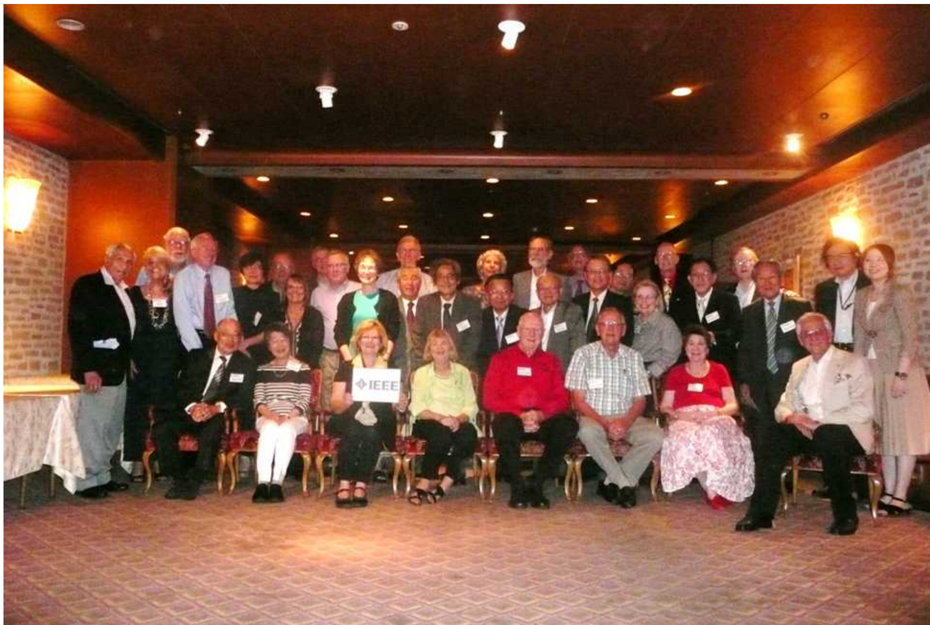
After the Farewell Dinner at Il Leone, 27 May