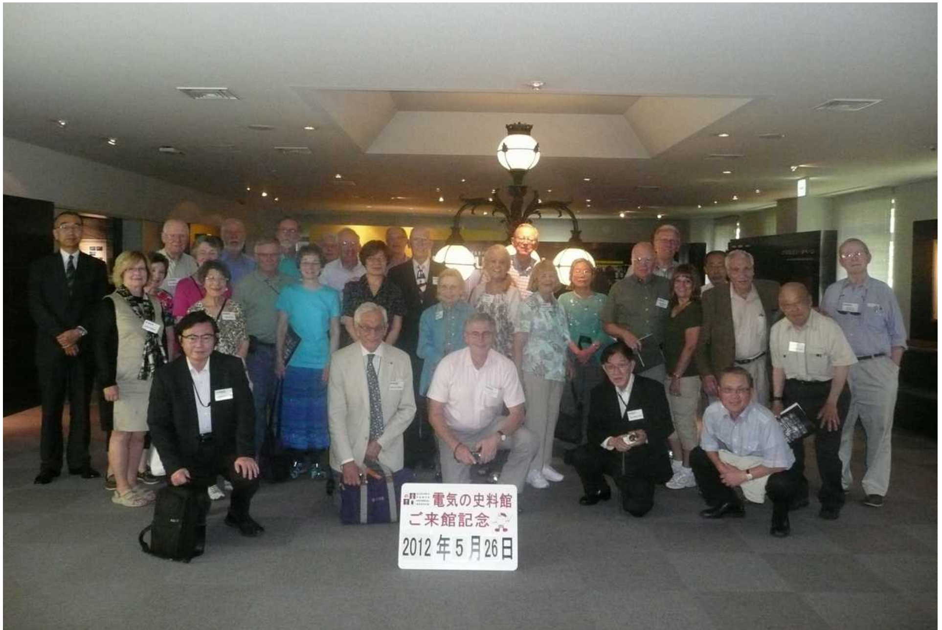
TEPCO Museum, 26 May