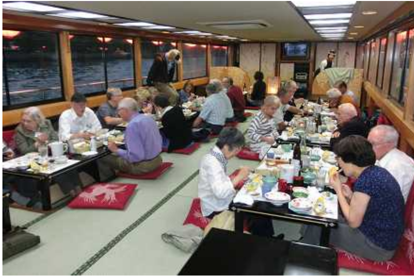
Dinner Cruise on the Sumida River, 25 May