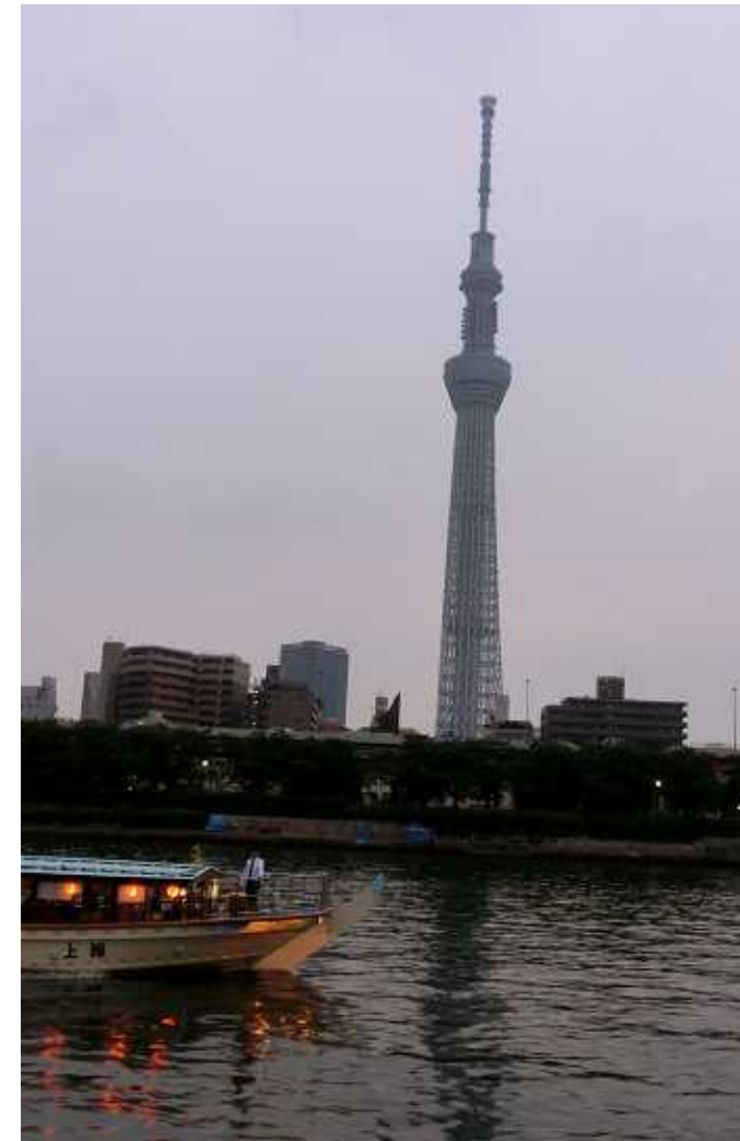
Tokyo Skytree, 634m high