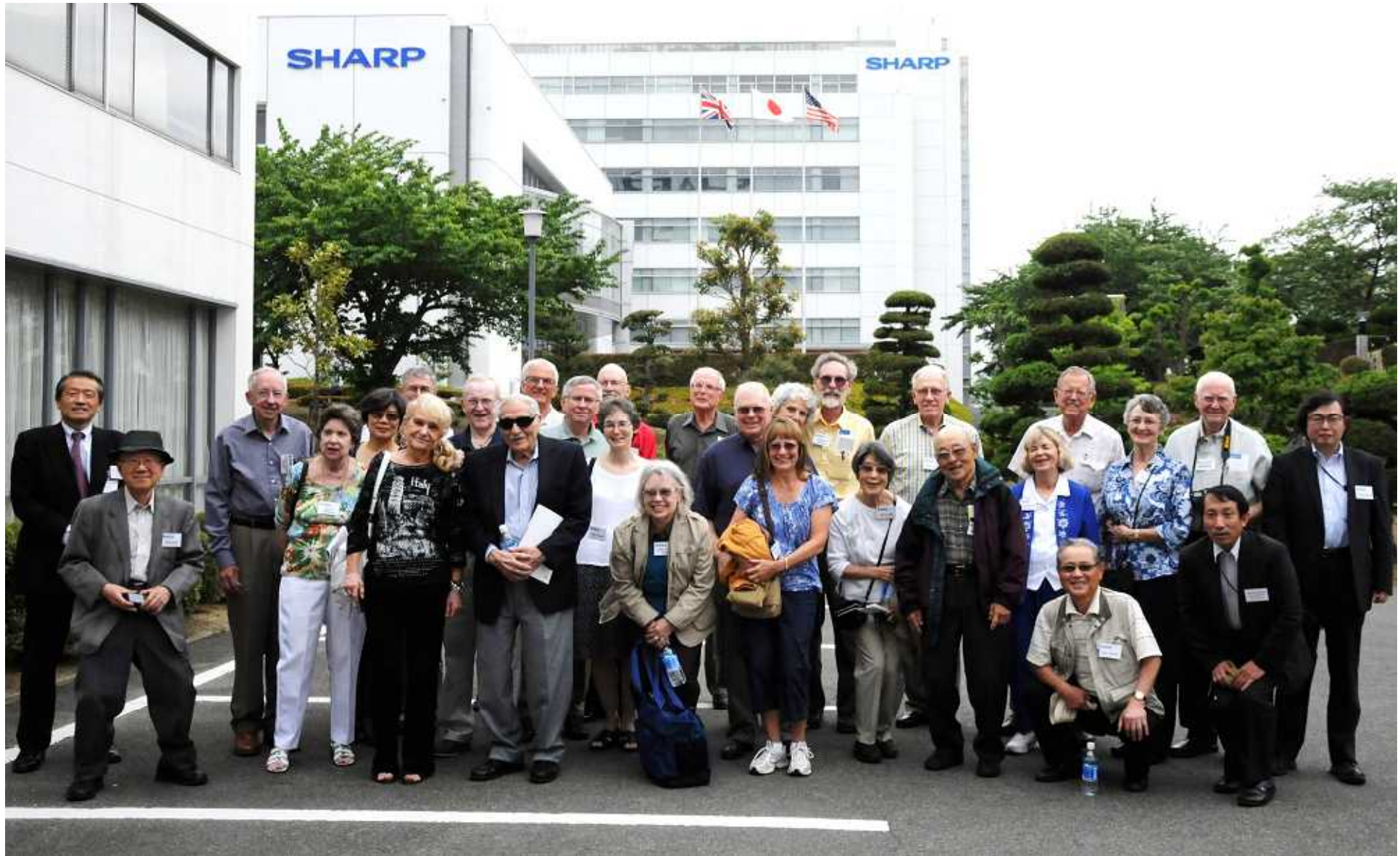
Sharp Memorial Hall, 21 May