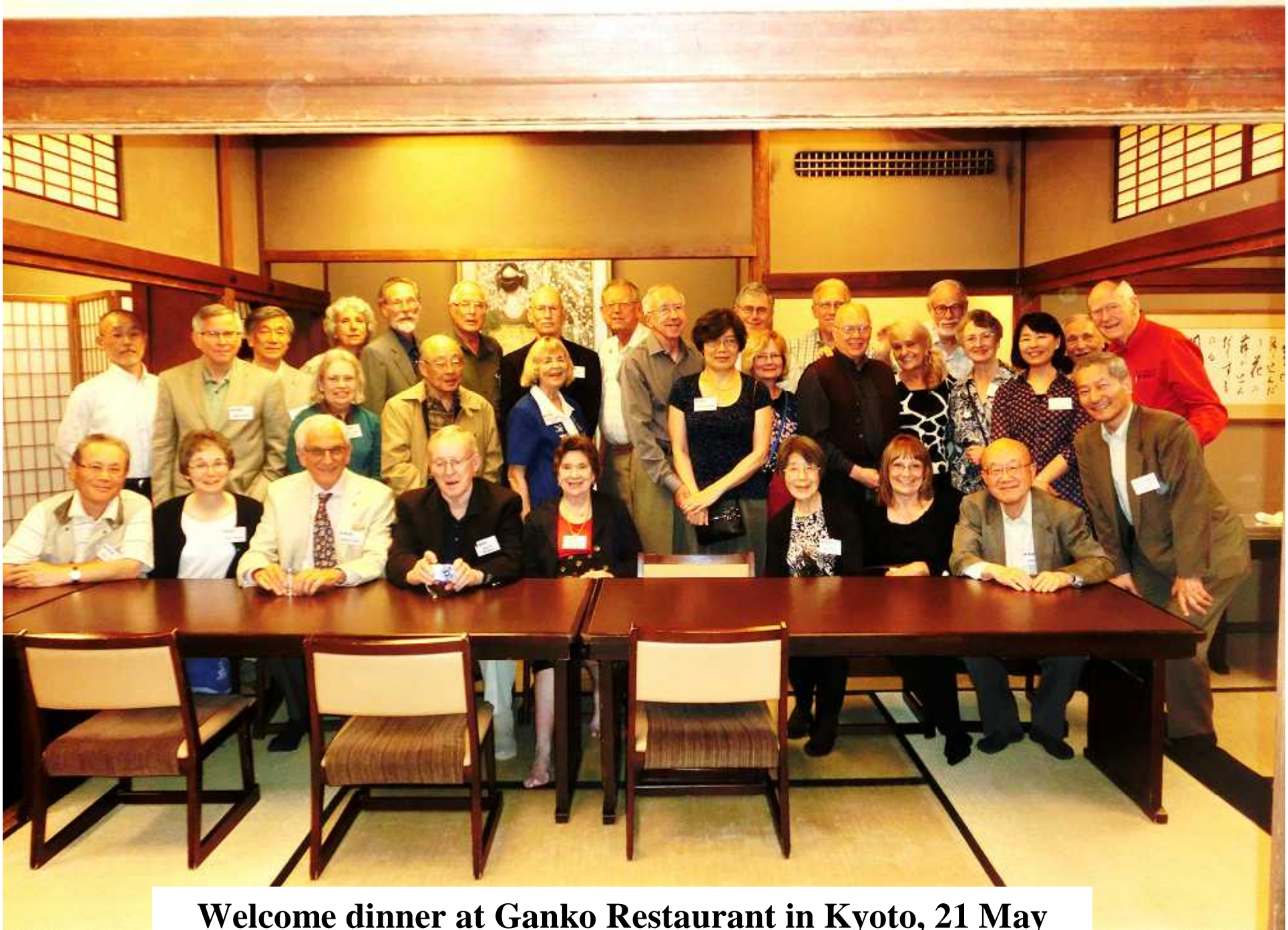
Welcome dinner at Ganko Restaurant in Kyoto, 21 May