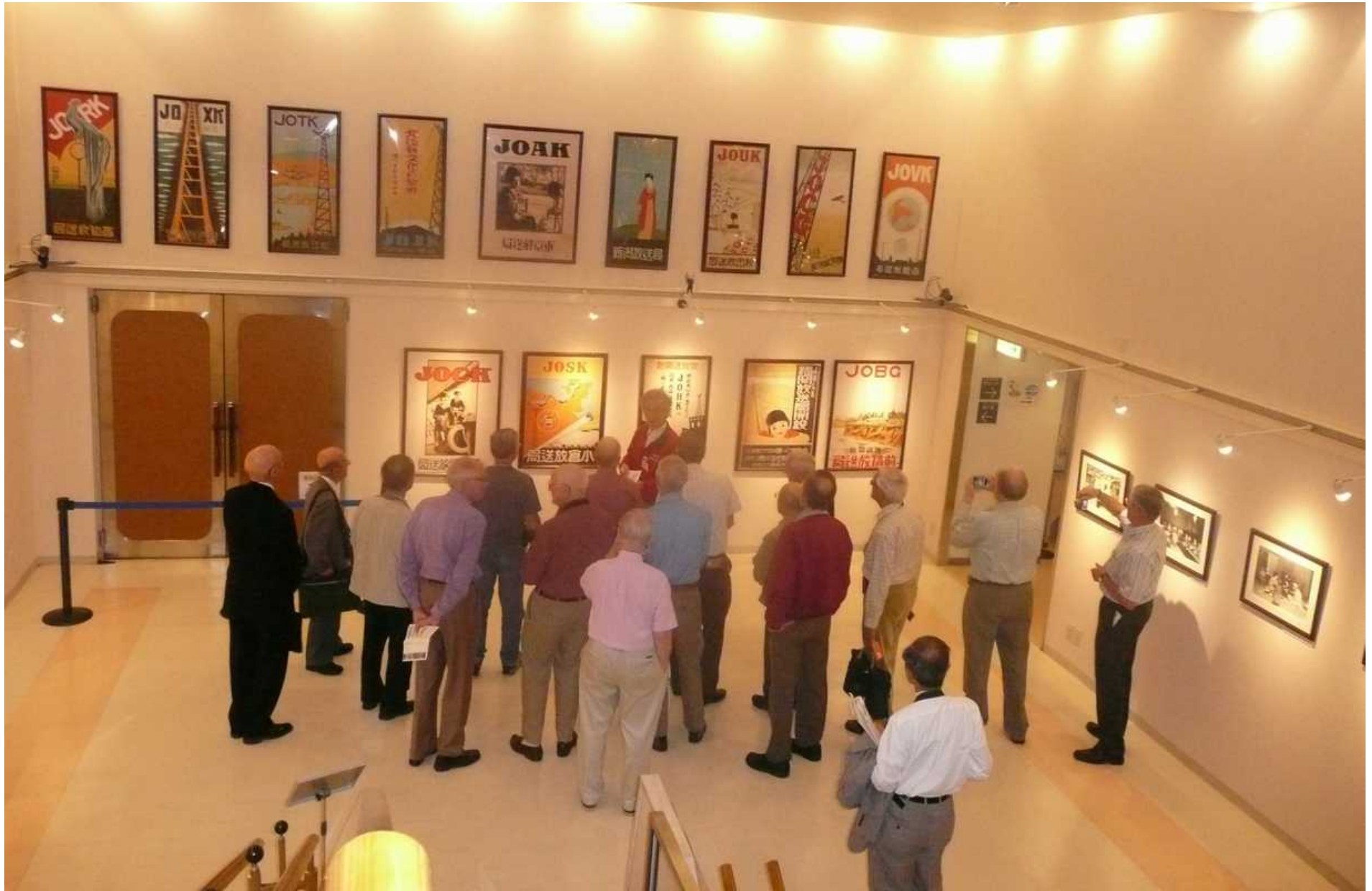
NHK Museum, 25 May