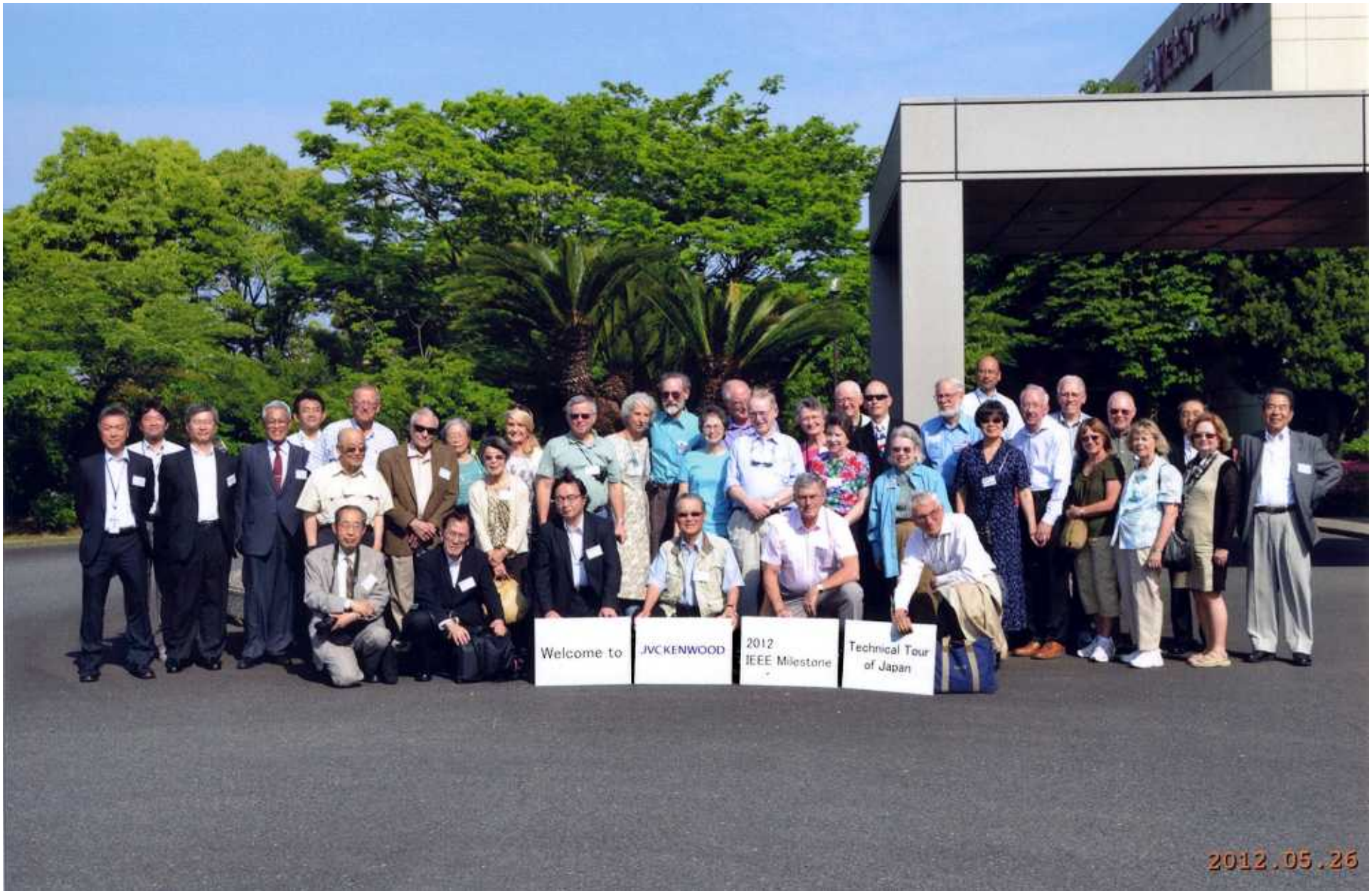
JVC Yokosuka, 26 May