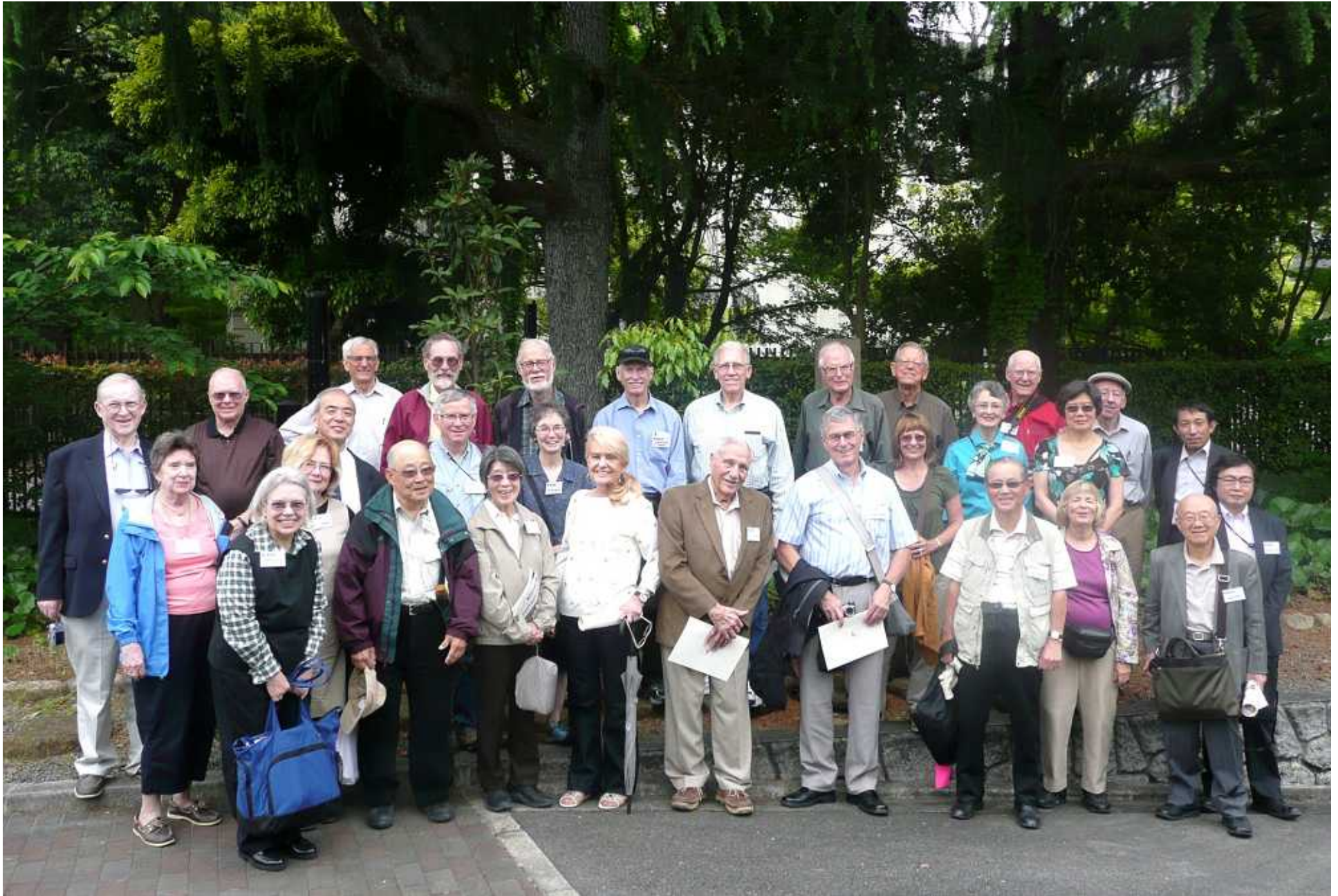
Keage Power Station, 22 May